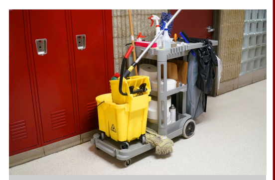
Follow your school's standard procedures for routine cleaning and disinfecting.

Disinfecting kills germs on surfaces or objects. Disinfecting works by using chemicals to kill germs on surfaces or objects. This process does not necessarily clean dirty surfaces or remove germs, but by killing germs on a surface after cleaning, it can further lower the risk of spreading infection.